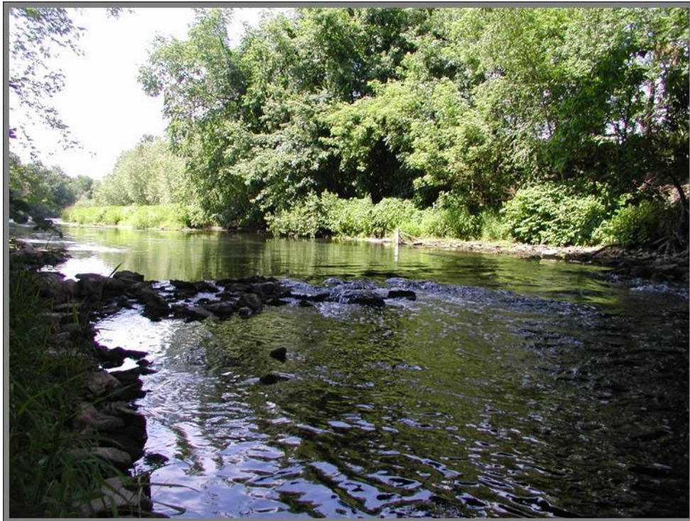
Blackstone River, Millbury, MA